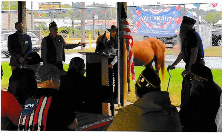
Ribbon cutting with Eau Claire Chamber of Commerce held on Sept 26